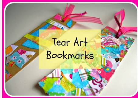
Tear Art Bookmarks