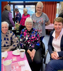
Above: Pink Ribbon Luncheon

Below: A treasured stained glass window @ St Mungo's